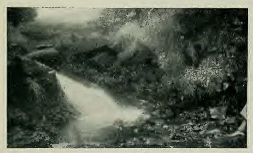
THE FALL OF WATER JUST ABOVE THE SITE OF LAST PHOTOGRAPH